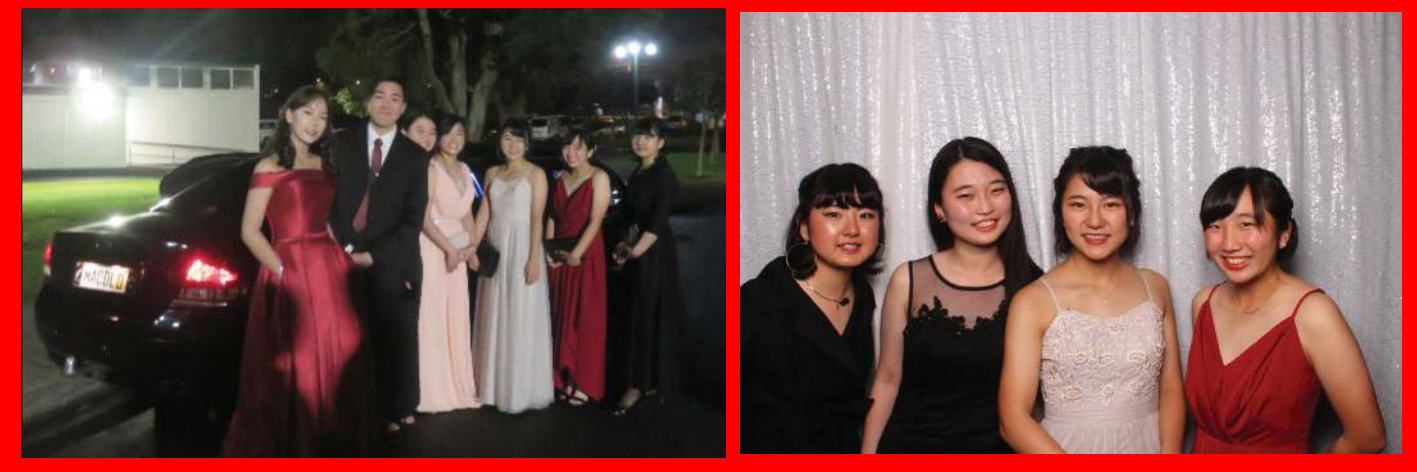
Don't they look fabulous?