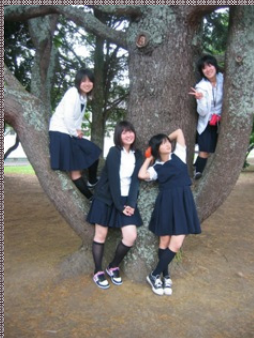
FUN TIMES: Hamamatsu Kita High School students from Japan relaxing in Henderson High School grounds on their stay in New Zealand.

His itinerary will also include visiting the first agents fair in Manaus, Brazil as well as visiting Santiago, Chile and North East, Brazil to see agents.